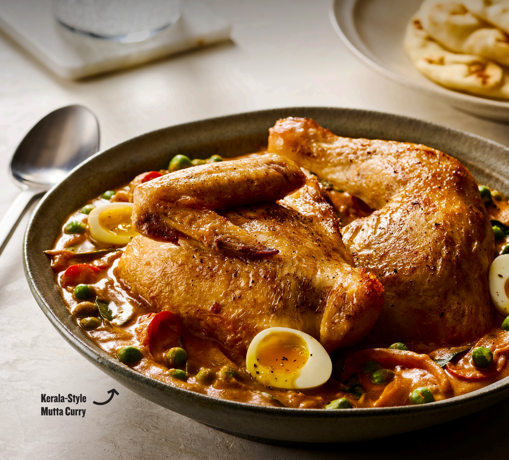
Kerala-Style Mutta Curry ↗